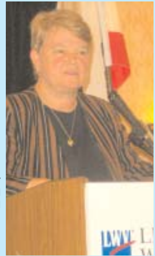
State Senator Sheila Kuehl speaks to the convention on the topic of Universal Health Care and a single payer method for California.